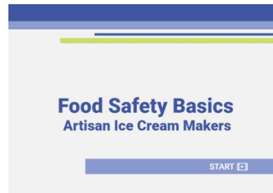
Ice Cream bit.ly/36tUPQh

These online training courses were designed for small to medium size cheese, ice cream, and frozen dessert manufacturers by food safety experts from dairy processors and academia (NCSU, UConn, Cornell, UW-CDR). Each is divided into short modules that can be taken over time to fit your schedule including: the importance of food safety, hazards, control strategies, GMP's, sanitations, and environmental monitoring. These low-cost courses are free with member code from the ACS, NICRA, DPC, or the IC. You'll also find many online courses through University dairy programs including NCSU's online Environmental Monitoring course bit.ly/3t7gacD and Cornell's online Sanitation course at bit.ly/3gSjohI