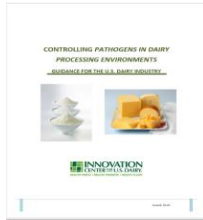
Pathogen Control Guidance Document

Food safety guidance documents are available for self-study, internal training, and to check your existing programs against. These regularly updated guides are prepared for the dairy industry by dairy industry subject matter experts to share knowledge/best practices on traceability and pathogen control topics including design, sanitation, GMP's, zoning, and environmental monitoring. Download at www.usdairy.com/foodsafety or click the image below.