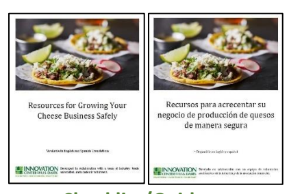
Checklist/Guidance Artisan/Fresh/Hispanic Styles