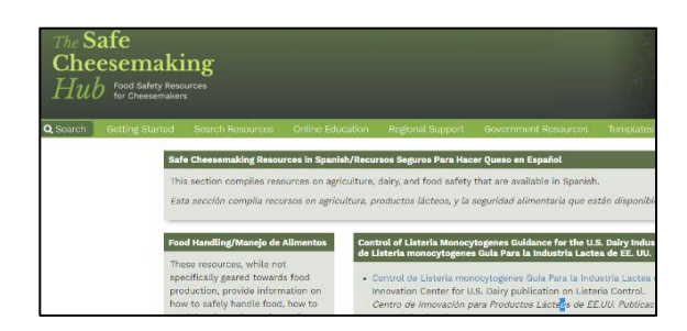
Safe Cheesemaking Spanish-Language Resources

The team has developed two Food Safety websites for Artisan, Farmstead, and small dairy processors which are hosted by ACS (Cheese focused) and IDFA (Ice Cream). Each site includes a 'Resources in Spanish section'