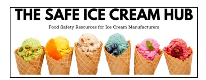
Safe Ice Cream Spanish-Language Resources